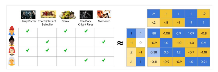
Matrix multiplication example from developers.google.com [1]

Here we assign value 1 to all positive examples which shows us that MF model can be easily applied to implicit feedback datasets. In our case we will use ratings (scale 1-5) instead.